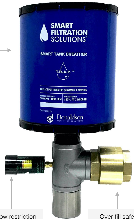
Air flow restriction indicator